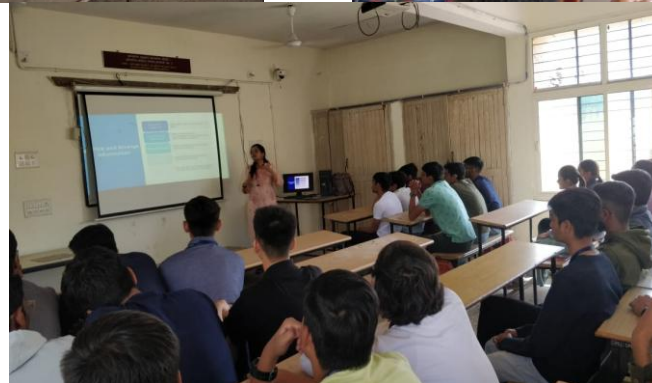
Figure 2 Live Session Photographs